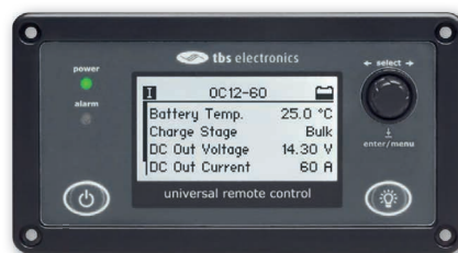
Universal Remote Control (Omnicharge), art # 5095500

TBSLink to USB Interface Kit, art # 5092120 (Includes TBS Dashboard for monitoring the Powersine inverters)