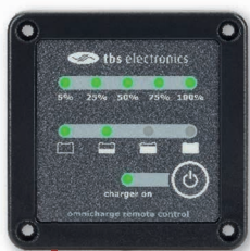
Basic Charger Remote Control, art # 5095220